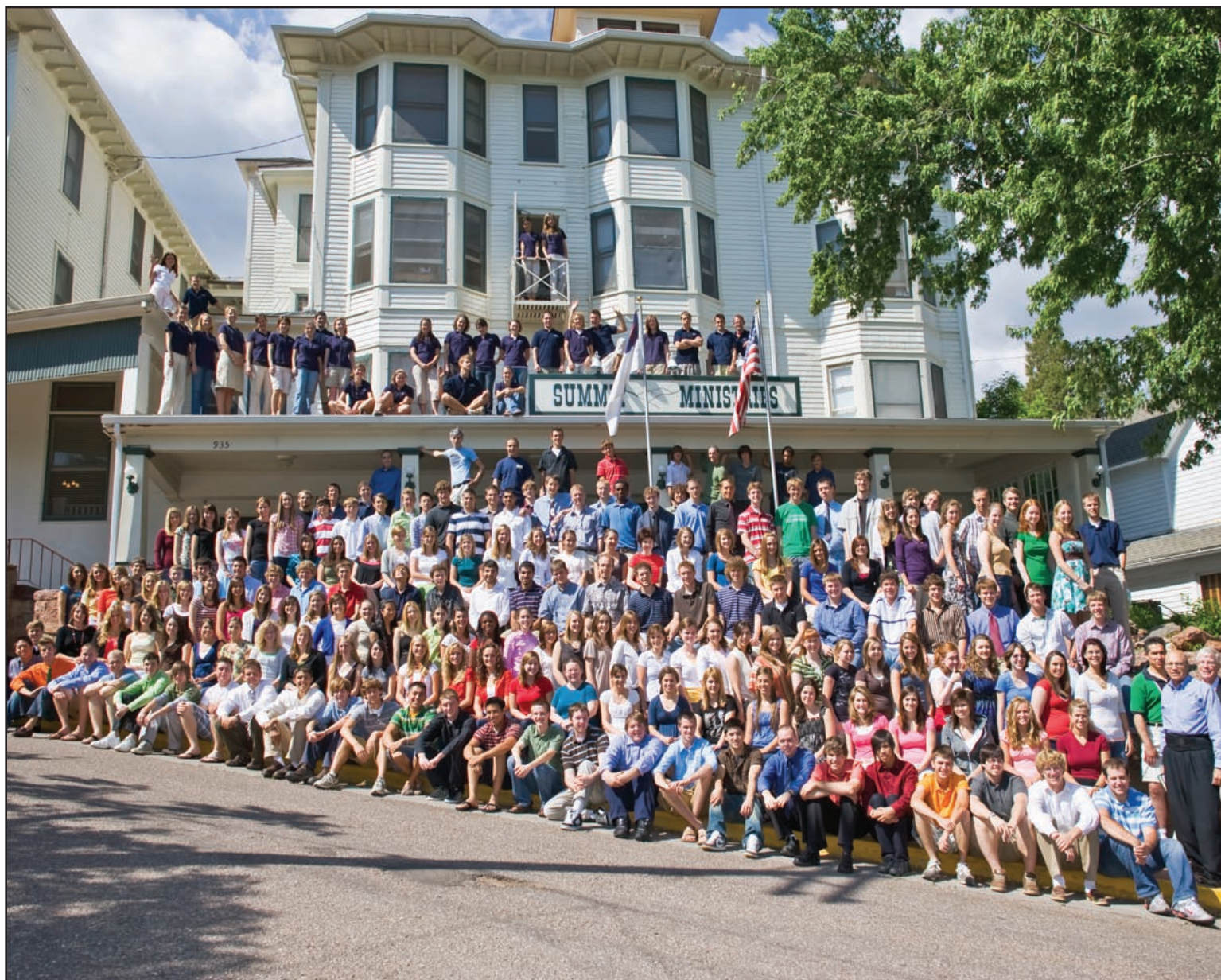
Session 3 - 2008 - Colorado

“Justice executed is a joy to the righteous but a terror to those who practice iniquity.”